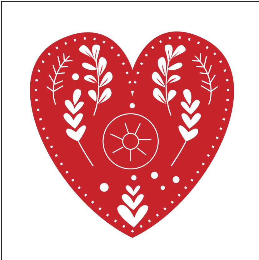
Gabarit à taille réelle Full size template